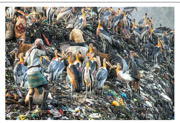
Fig. 2 Tie for overall runner-up. "Greater Adjutant Stork ( Leptoptilos dubius ) foraging." Attribution: Dhritiman Das.