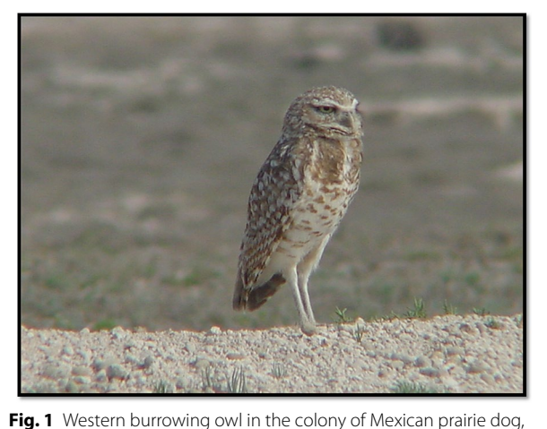
in Chihuahuan Desert

areas in the USA and Canada, to reduced, extirpated or increasing in others [2, 7-16].