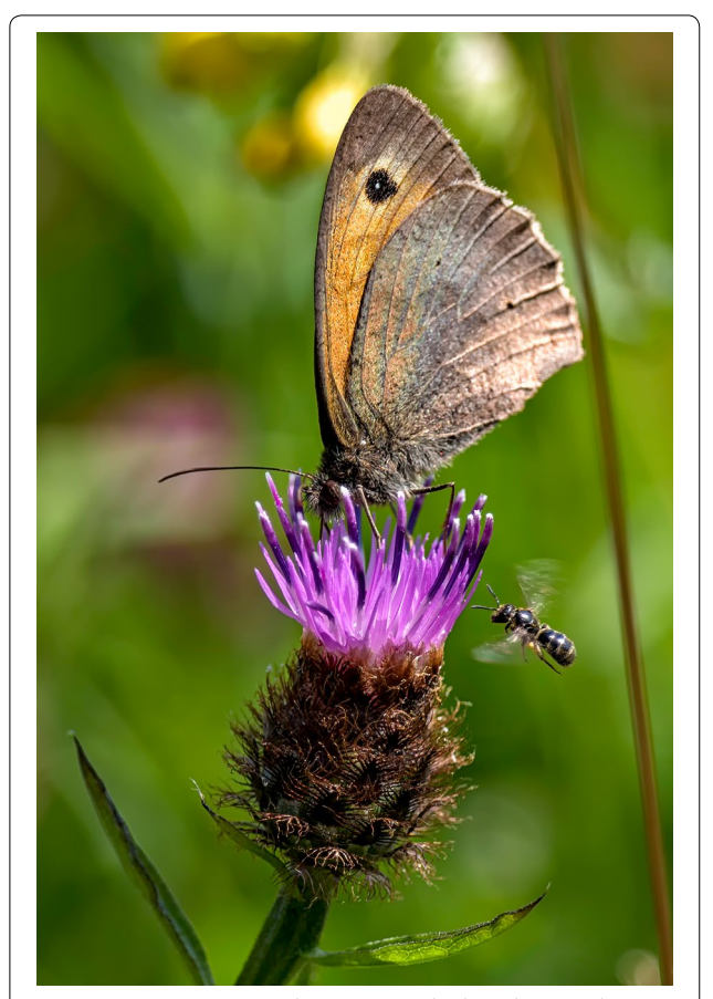
Fig. 6 Section winner: Meadow Brown and solitary bee. Attribution: William Mills (University of Brighton, UK)

random or periodic disturbances. This picture is a nice illustration of the destructive power of an extreme disturbance that will create the opportunity of reinitiating ecological succession. It captures the simultaneous end and beginning of many eco-evolutionary processes—a wonderful example of what A. L. Lavoisier (1743–1792) famously stated: "nothing is lost, nothing is created, everything is transformed."