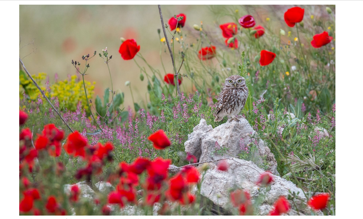
Fig. 5 Winner: little treasures of the steppes. Attribution: Pilar Oliva Vidal (University of Lleida—ETSEA, Spain)

Section Editor Michel Baguette explains his rationale for selecting this picture. "Landscapes can be defined as a patchwork of different habitats that develop according to local environmental conditions (climate, geomorphology) and disturbances. Ecological successions—the gradual processes by which ecosystems change and develop over time—drive habitats to their climactic states, while disturbances damage or destroy the climax and relaunch the successions. A landscape is thus a shifting mosaic in space and time of successional habitats generated by