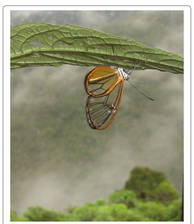
Fig. 1 Overall winner: the enigmatic clearwing butterfly Hypomenitis enigma (Nymphalidae:Ithomiini). This photo was taken in the southern Andes of Ecuador (2000 masl, Zamora-Chinchipe province) 2 h after the butterfly had emerged from its chrysalis